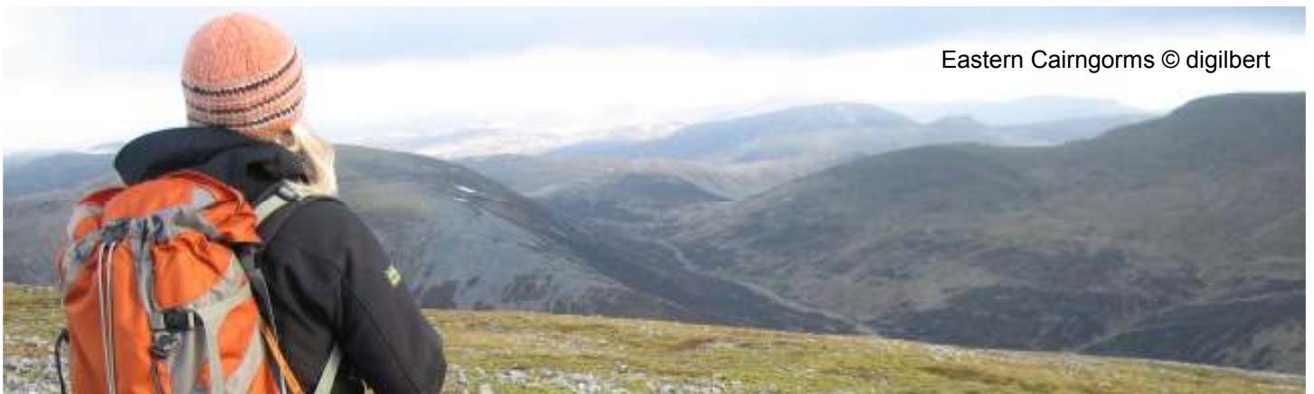
Eastern Cairngorms