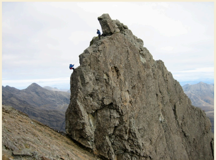
The hardest Munro of the lot - Sgurr Dearg, better known as 'The Inn Pin'

If you require more information about these days, I highly recommend the SMC's book titled "The Munro's".