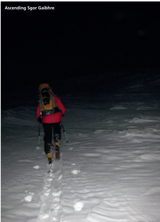
Ascending Sgor Gaibhre

Sleep in those searing cold conditions eluded us. The stove refused to work, water froze and part of the crown on my front tooth fell out. Looking to the positive, there was certainly not a problem with missing the first train in the morning as the London sleeper would be first through.